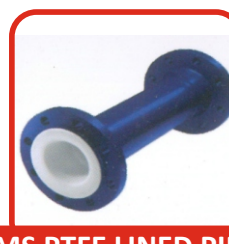
MS PTFE LINED PIPE & FITTING, VALVES