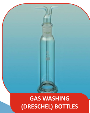
GAS WASHING (DRESCHER) BOTTLES