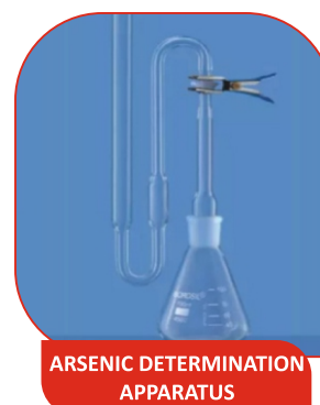
ARSENIC DETERMINATION APPARATUS