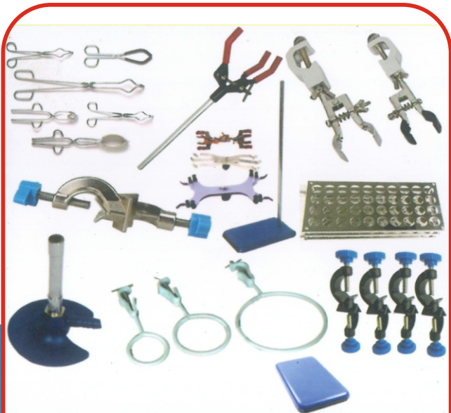
BOROSIL LAB ACCESSORIES